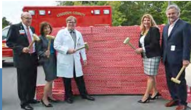
The brick-breaking ceremony for the upcoming Inova Virts Miller Family Emergency and Trauma Center took place in September 2016.